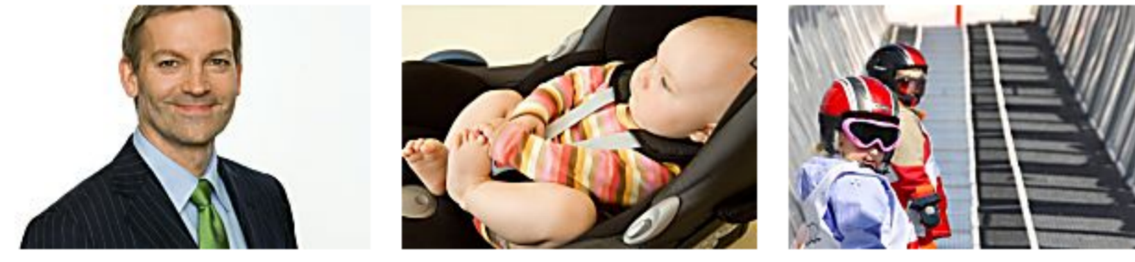
Old Mutual embarks on 'managed separation' of four business uni... Investment Week El 45% de los padres desconoce las medidas de seguridad para ... 2 minutos Ein schräges Land Frankfurter Allgemeine Zeitung