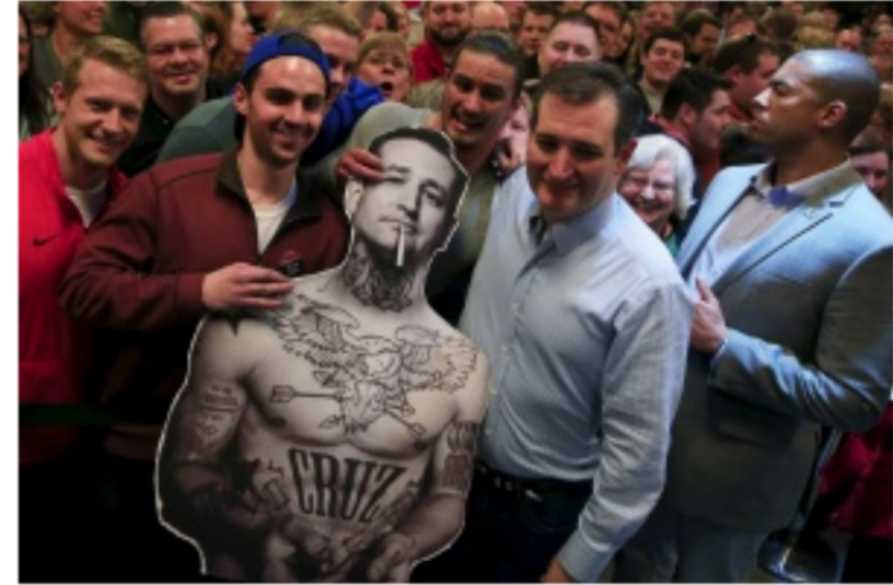
Candidate caricatures on the campaign trail. Slideshow »