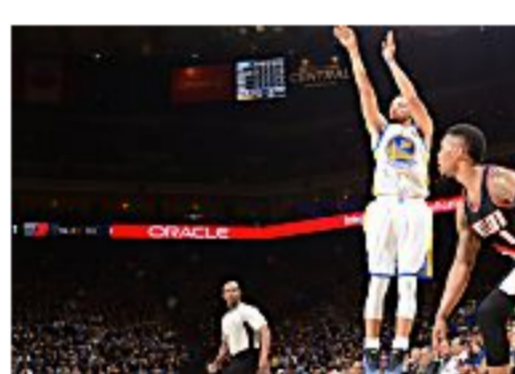
Stephen Curry erzielte 34 Punkte Sport 1