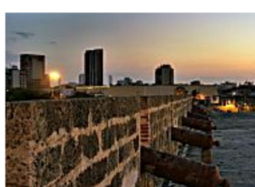
De tirar o fôlego: conheça as mais charmosas cidades colo... Correio Brazil