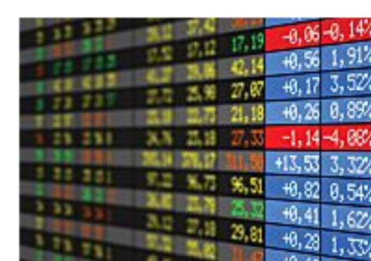
Lloyds soars but election concerns hamper FTSE Investment Week