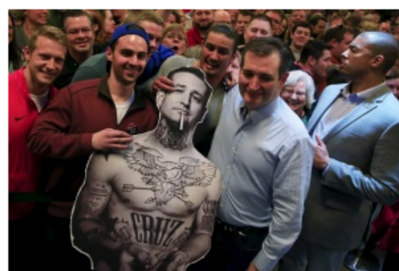
Candidate caricatures on the campaign trail.