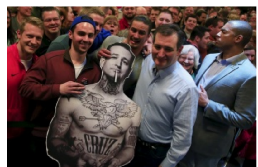
Candidate caricatures on the campaign trail. Slideshow »