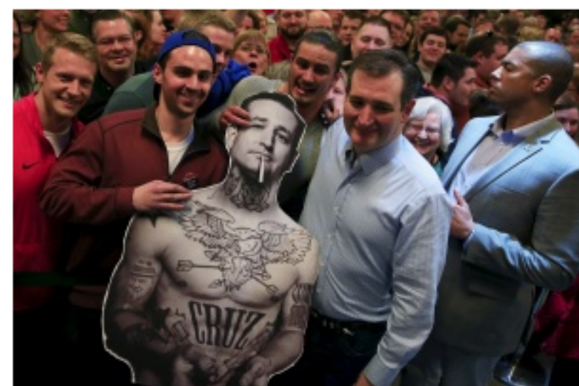
Candidate caricatures on the campaign trail. Slideshow »