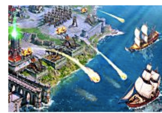
Stormfall : Le Jeu Gratuit Phénomène de 2015 Stormfall - Jeu en Ligne