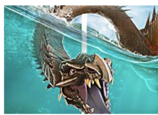
Pirates: Le Jeu de Stratégie Massivement Multi-Joueurs et ... Pirates - Jeu en Ligne