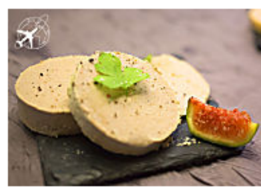
Livraison gratuite des meilleurs foies gras français au Japon Foiesgrasgourmet.com